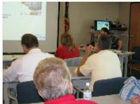
More than 30 participated and passed a ServSafe course presented by the Environmental Health staff.